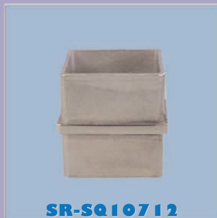
Flush joiner "in-line"