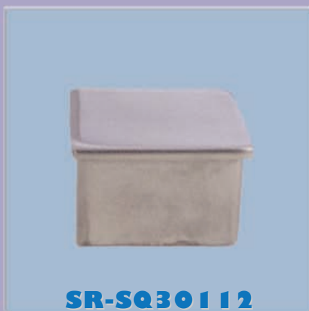
End cap flat