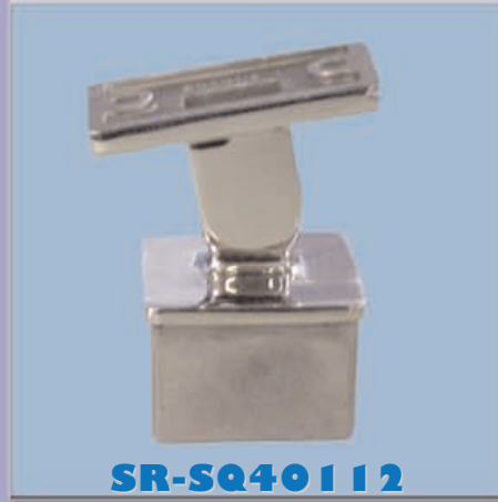
Adjustable rail support