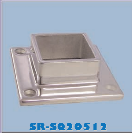
Square base plate flange